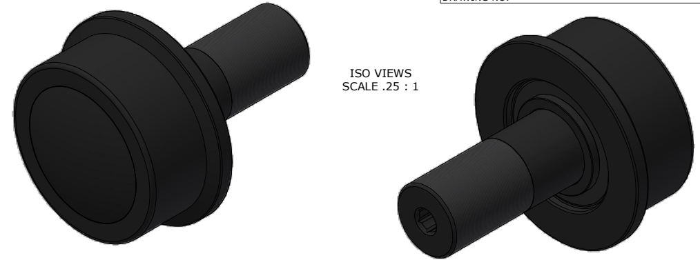
ISO VIEWS SCALE .25 : 1

SIGNED DRAWING APPROVAL REQUIRED PLEASE REVIEW AND VERIFY INFORMATION ON ALL SHEETS & RETURN COPY WITH SIGNED AND DATED APPROVAL, AND/OR REQUIRED CHANGES. CARTER WILL NOT PROCEED WITH ORDER UNTIL APPROVAL IS RECEIVED SIGNED _____ DATE _____ APPROVED REJECTED